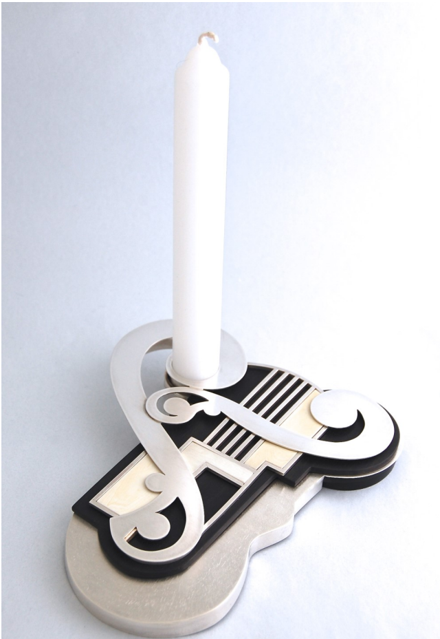
Left: Candlestick by Jackie Anderson.

The piece is Jackie's entry in Laura Brandon's upcoming exhibition "Illuminating" - a contemporary interpretation of a classical feminine shape, a vintage music stand. Deconstructed with curvilinear silver shapes flowing over five silver linear elements with vintage piano key ivory and ebony inlay. These elements reference music lines, string instruments, and piano.